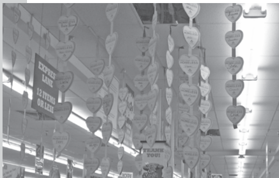
L&L Food Centers hung our hearts.