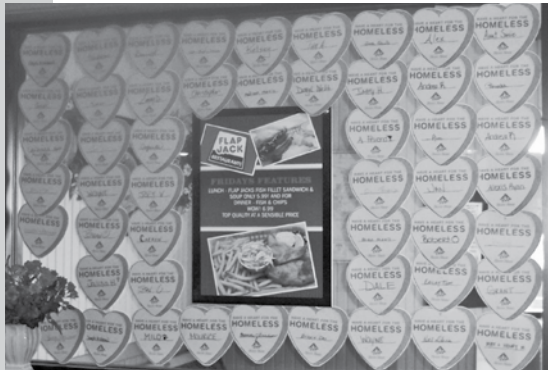
Flap Jack took our campaign to heart.